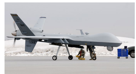
A B-1B bomber takes off from Ellsworth AFB to take part in a training exercise (top). Ellsworth ground control facilities remotely employ MQ-9 Reaper unmanned aircraft (bottom).